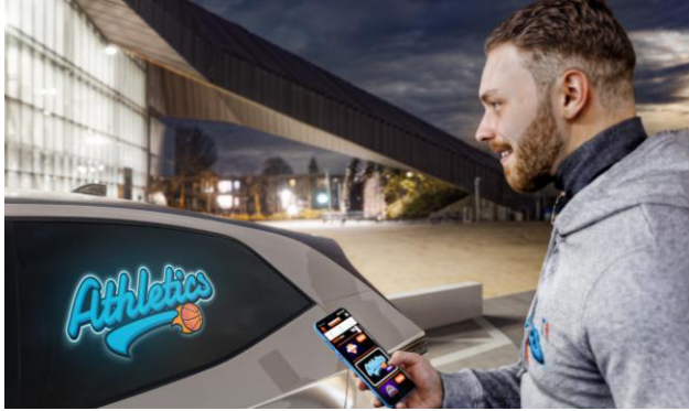
1st Small Projector for Automotive